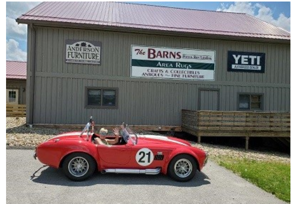
The Barns at Potter Run Landing