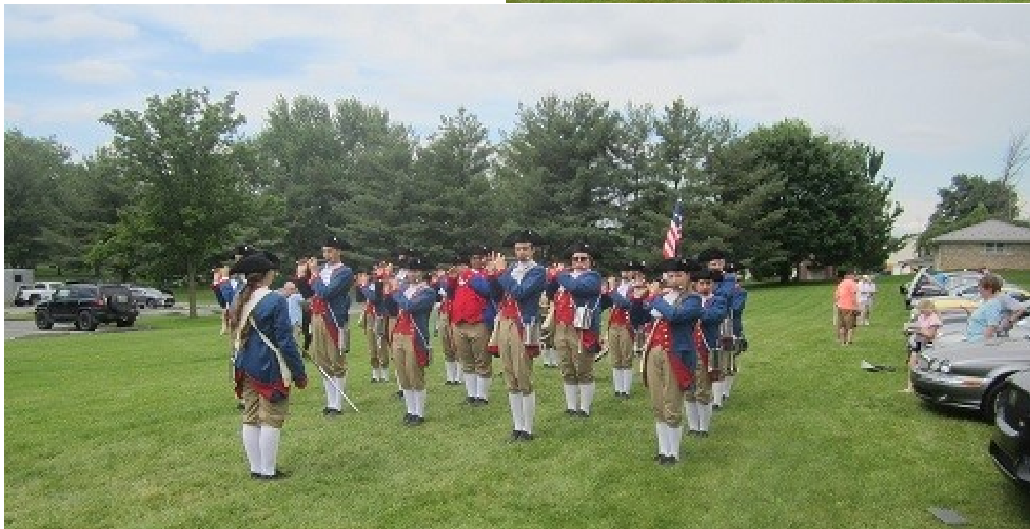
Patriotic music provided by a local student Fife and Drum Corps added to the spirit of the SVJC Concours held during Memorial Day weekend.