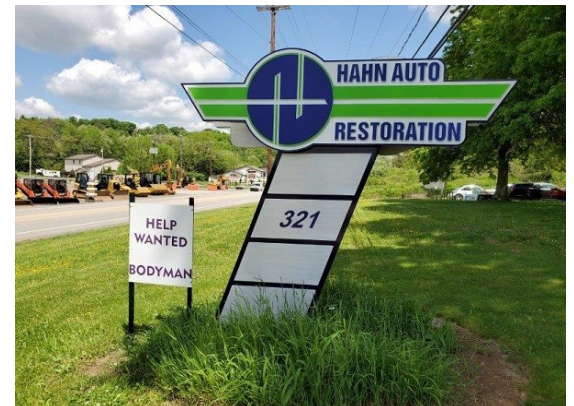
Hahn Auto Restoration