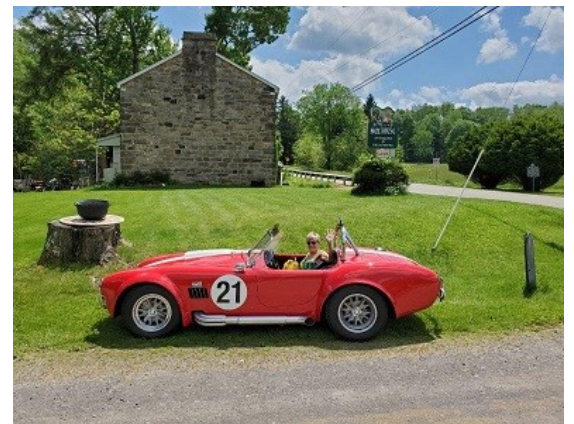
The Nut House for Dessert