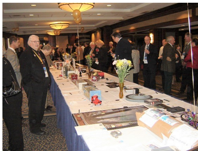
A sample of our AGM Silent Auction items

The Jaguar Club of Pittsburgh was responsible for many good memories for the attendees of the Jaguar Clubs of North America's 50th Annual General Meeting. It was also a testament to all the JCOP members' efforts and what this club can accomplish through hard work and everyone dedicated to a common cause.