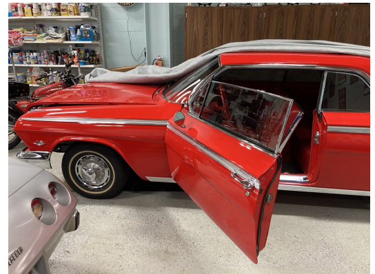
Gary's 1962 Chevy Impala SS

until there is a place to exhibit it. The "SE" stands for "Special Equipment" but in actuality that was the Jaguar way of saying in 1956 that the car has an automatic transmission.