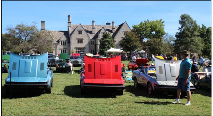
Above: Overview of the show field at Hartwood