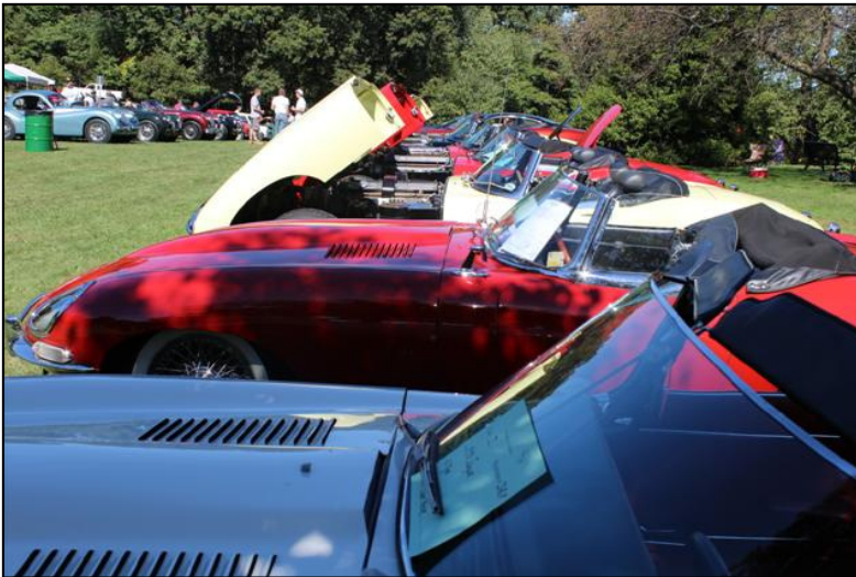
A lineup of E-Types is always a grand sight.