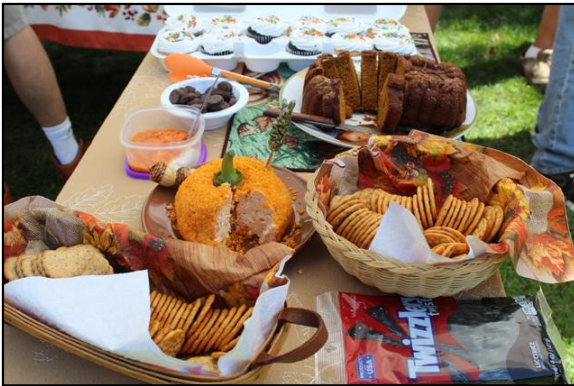
The Hartwood team and other JCOP members contributed goodies to a Taste of Fall food table.