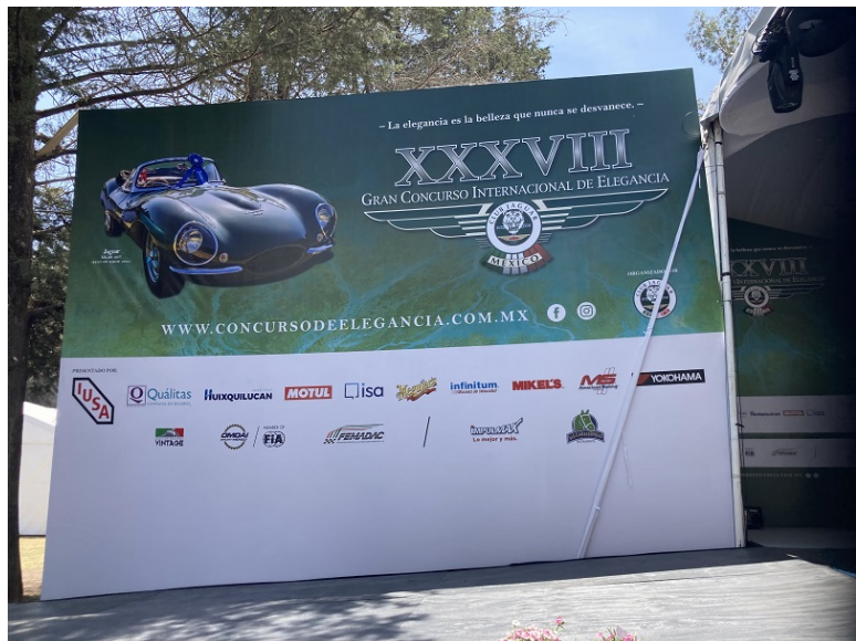
Signage for the Mexican International Grand Concours d'Elegance with the 2025 Best of Show Jaguar XKSS