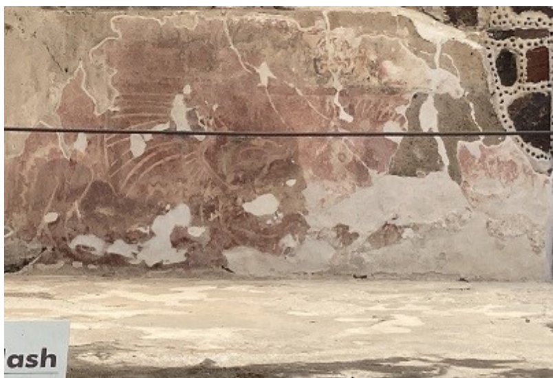
Photo of the painting of the revered jaguar in the unearched lower level of the Teotihuacan pyramids