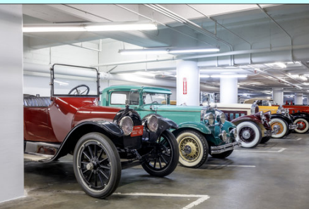
Turn-of-the-20th-century cars, head-of-state vehicles, American classics and award-winning hot rods are among the museum’s collection.