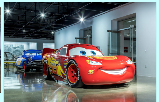
Lightning McQueen outside Petersen Automotive Museum’s Discovery Center.